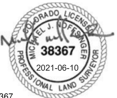
ILLUSTRATION ATTACHED AND MADE A PART HEREOF.